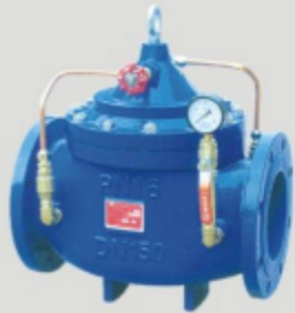
300X Microresistance slow closing check valve