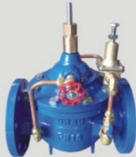
400X Flow Control Valve