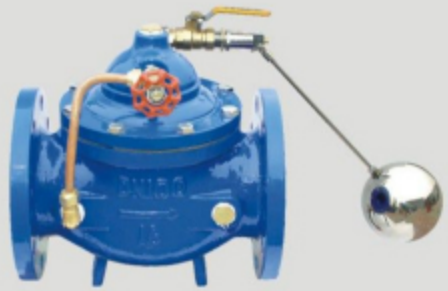
100X Float Valve