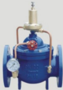
500X Pressure Relief Valve