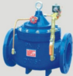
600X Solenoid Valve