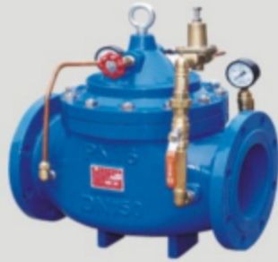
200X Pressure Reducing Valve